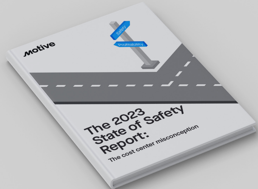
The 2023 State of Safety Report

While some companies are worried about driver pushback, businesses that deploy safety technology actually retain more drivers in the long run, not less.